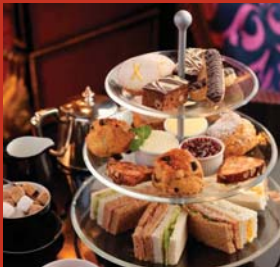
Afternoon Tea at Prestonfield