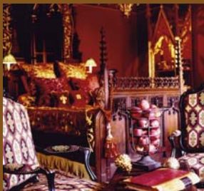
Old Rectory Suite

Stays at the Witchery Suites are also available as a gift voucher.